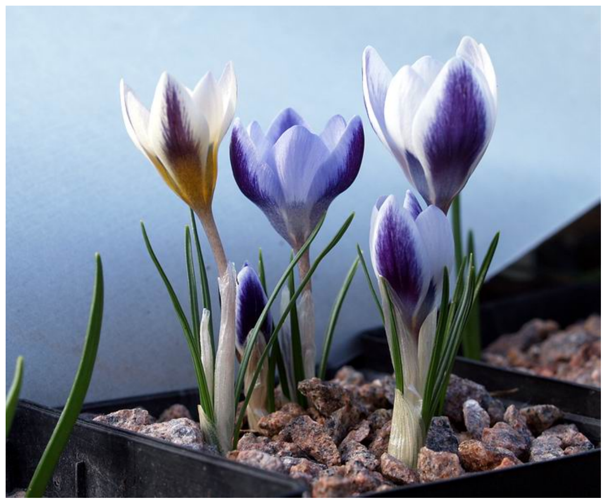
Crocus biflorus ssp alexandrii

The variation you should see in these Crocus biflorus ssp alexandrii shows why I do like to grow my bulbs from seed.