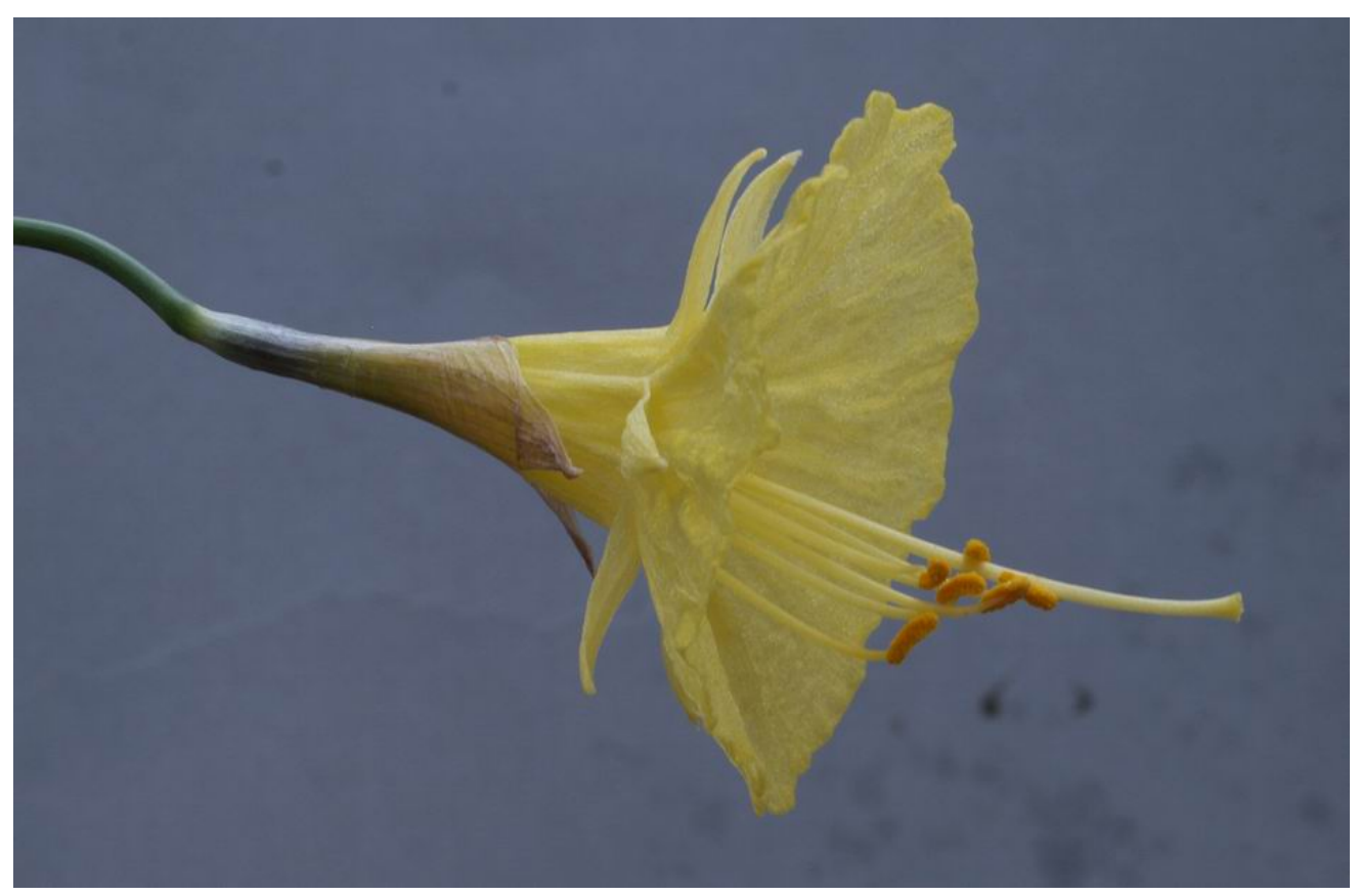
Narcissus romieuxii 'Atlas Gold'

Starting from the left is one of the deepest yellow selections of Narcissus romieuxii well named 'Atlas Gold'. Unfortunately no matter what I try I have never managed to capture a picture that shows the yellow that I see with my eyes.