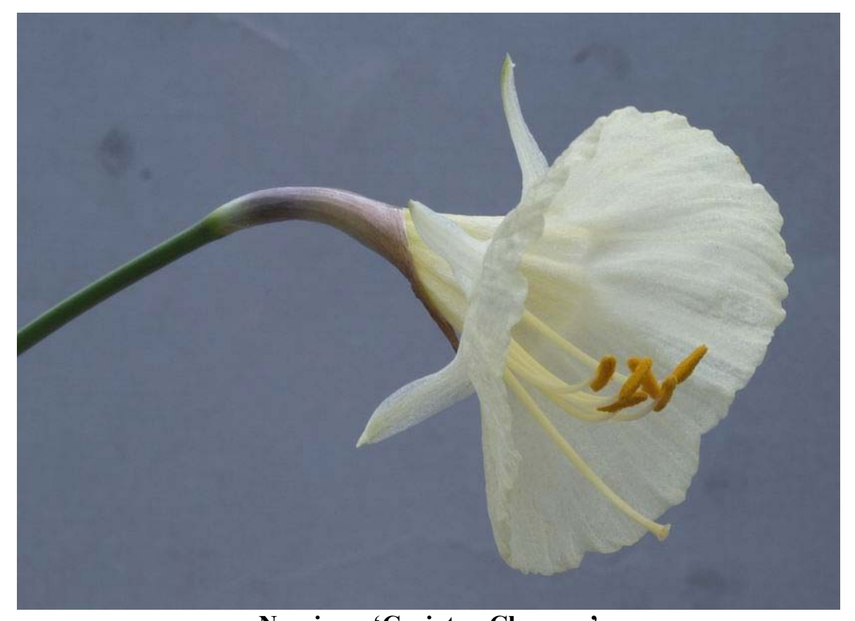
Narcissus 'Craigton Clumper' The final one is Narcissus 'Craigton Clumper' a selection I made and named a few years ago.