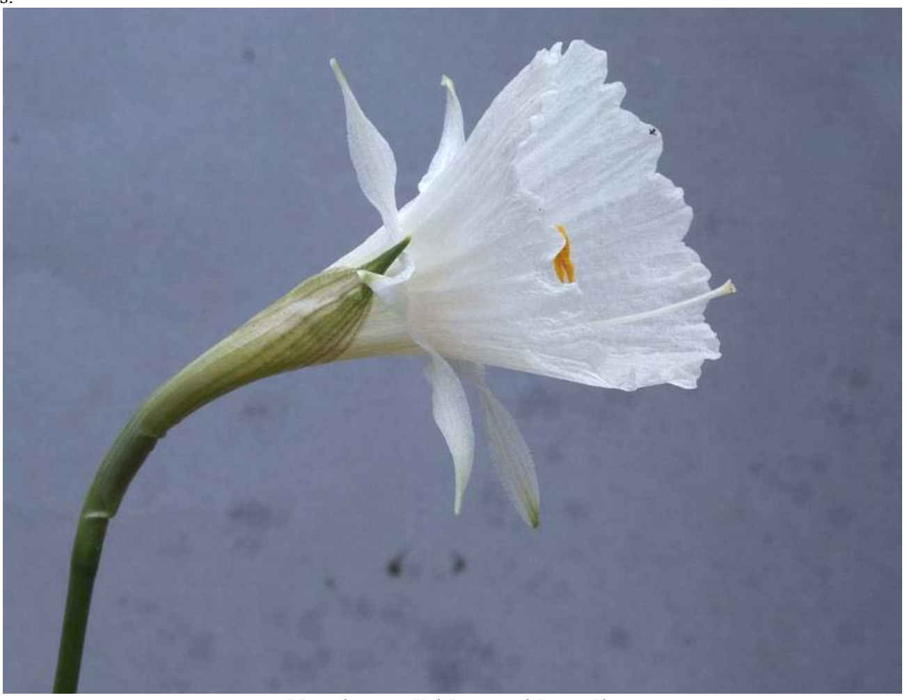
Narcissus albidus occidentalis

Starting from the left is one of the deepest yellow selections of Narcissus romieuxii well named 'Atlas Gold'. Unfortunately no matter what I try I have never managed to capture a picture that shows the yellow that I see with my eyes.