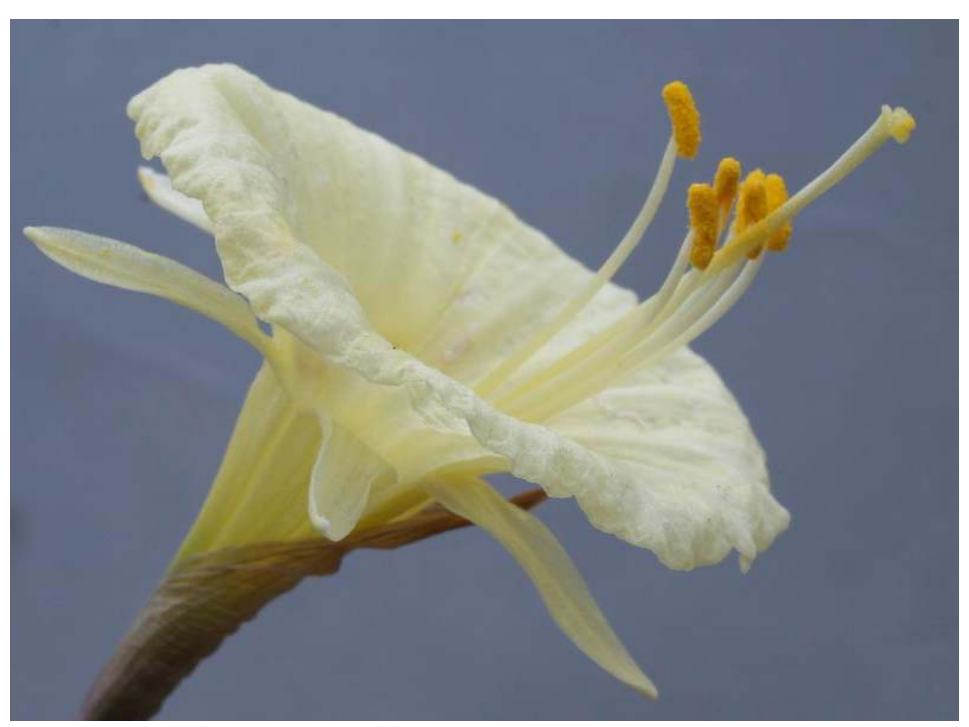
Narcissus romieuxii ssp tananicus